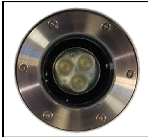
12V AC / DC